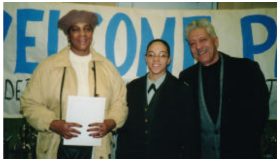
Jr. ROTC student volunteer guides her parents at a Collinwood Report Card Pick-up Night.

Adapted from: Promising Partnership Practices—2001 , National Network of Partnership Schools at Johns Hopkins University.